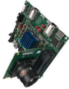
MVDK with MIPI CSI-2 Receiver interface board

The MIPI CSI-2 Receiver IP Core is delivered as encrypted VHDL. It is optionally available as VHDL source code. It is compatible with Xilinx Artix7, Kintex7, Zynq7 and Ultrascale+ FPGAs. The MIPI CSI-2 Receiver IP Software library is delivered as an object file. It is optionally available as C source code.