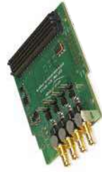
CoaX interface board

Sensor to image MVDK development kit is a flexible evaluation platform for machine vision applications. It supports CoaXPress host and device reference designs and various Encustria™ FPGA modules with Intel and Xilinx FPGAs.