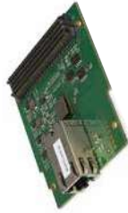
NBASE-T interface board

Sensor to Image MVDK development kit is a flexible evaluation platform for machine vision applications. It supports GigE Vision host and device reference designs and various Enclustra™ FPGA modules with Intel and Xilinx FPGAs.